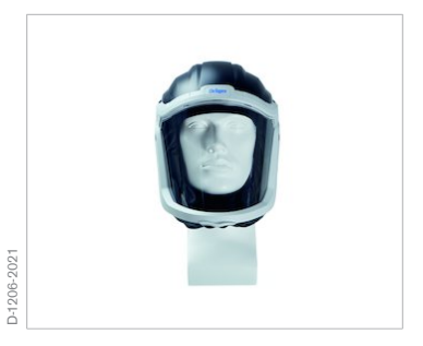
Dräger X-plore® 8000 Face Shield - front view