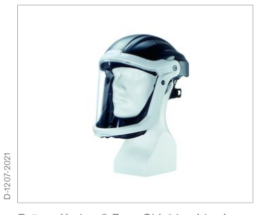
Dräger X-plore® Face Shield - side view