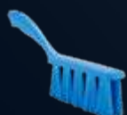
UST Bench Brush, Medium Art. no: 4585x