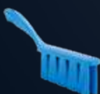
UST Bench Brush, Soft Art. no: 4581x