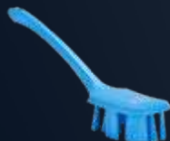
UST Long Handled Hand Brush, Stiff Art. no: 4196x