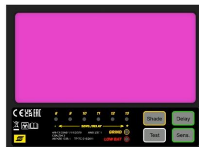
New multi-color LED display