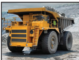
Specialty Trucks, such as Dump Trucks, Garbage Trucks, Concrete Trucks, Utility Trucks